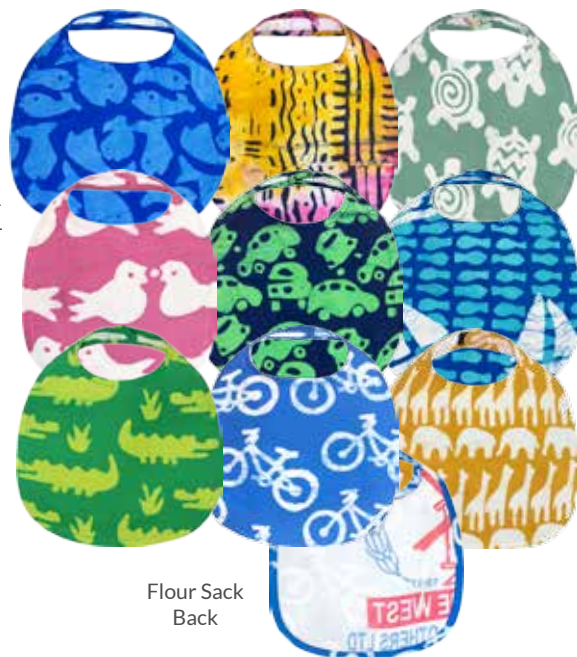
Flour Sack Back

School of Fish-Blue: 10910021 Pathways-Rainbow: 10910271 Turtles-Sage: 10910251 Two Birds-Rose: 10910281 Cars-Lime: 10910091 Sailing-Blue: 10910231 Crocs-Lime: 10910191 Bikes-Blue: 10910261 Sahara-Mustard: 10910221